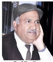
By: Vijay Garg

At the same time, due to negligence in the diet and lack of vitamin D and calcium and their lack in our diet today, there has been an increase in bone related problems. Due to the lack of protein, calcium, phosphorus, vitamin D in the diet for a long time, the risk of these diseases has increased manifold. Today depression is also emerging as a problem. Especially, in urban areas, it is believed to be the result of changing